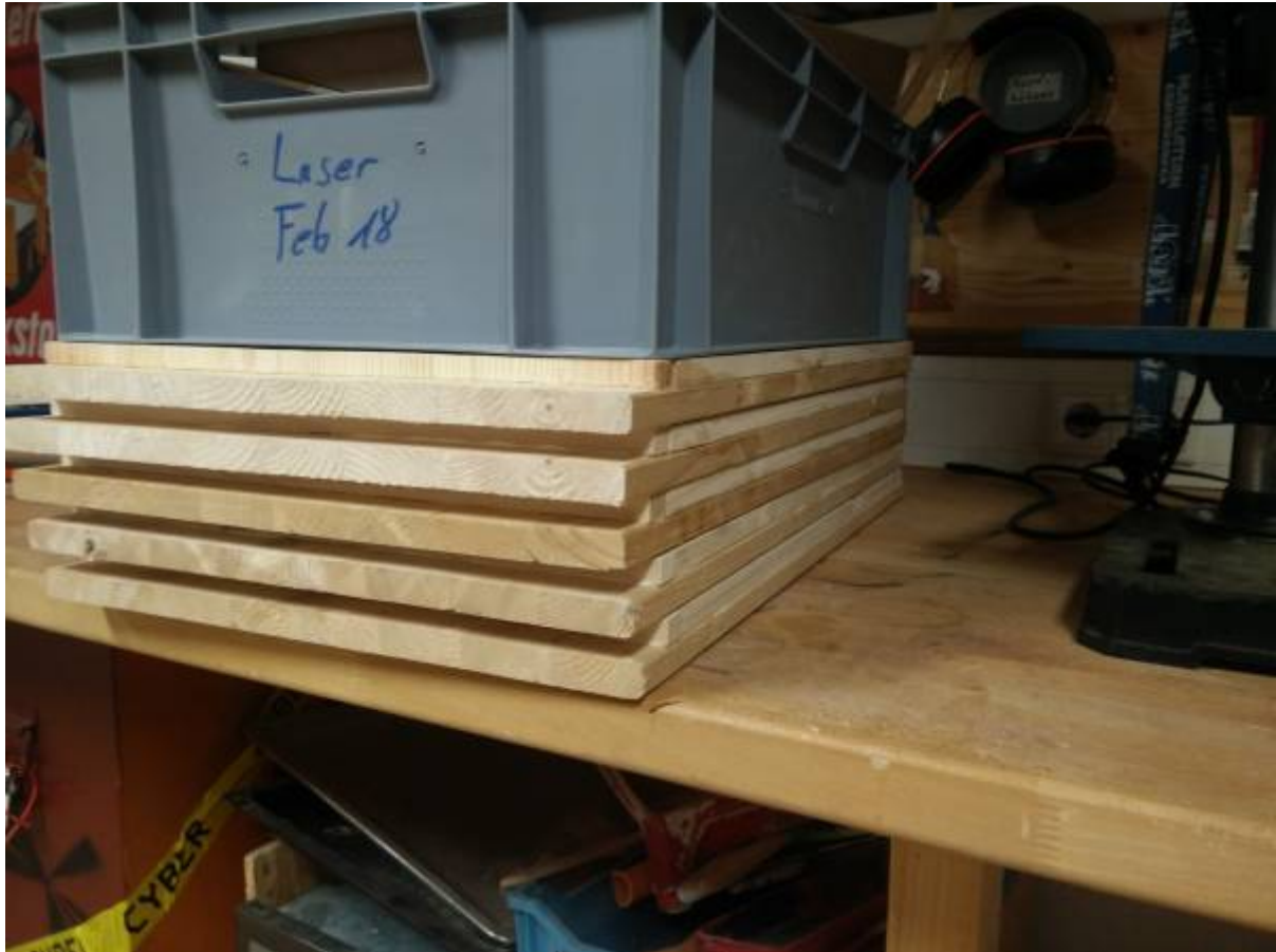
Stack of 5 boards being glued.

The Hoverbaord-Motors are suspended with the help of the old wheel suspensions. To do so, they have to be cut down, as they are not perfectly flat. Don't forget to deburr the fresh cut edges, they can be dangerous for the cabling.